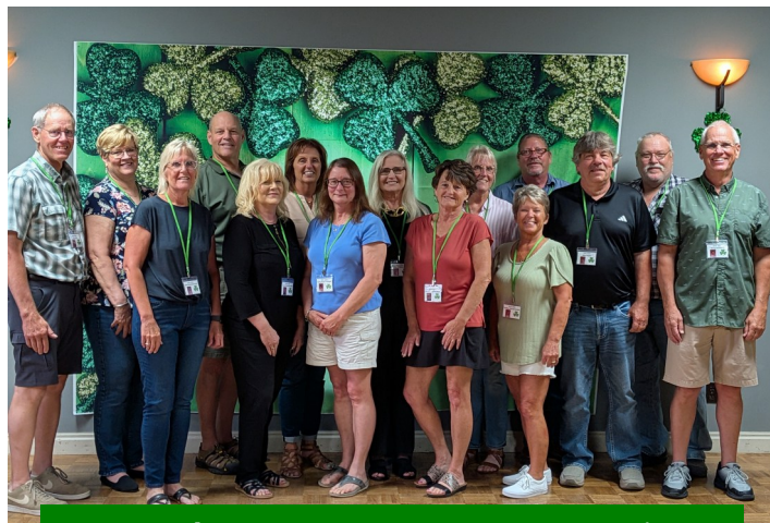
SHS Class of 1976: 50-Year Reunion

New this year, the Beanstalk will carry Bermuda-style shorts which are uniform approved!