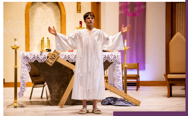
2025 Living Stations