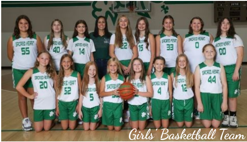
Girls' Basketball Team

We invite you to join us Tuesday, November 12 as we recognize our eighth grade girls' basketball players and their parents! Game time is 6:00pm against Cumberland. The recognition ceremony will take place between the seventh and eighth grade games. This is our last home game of the season. We would love to pack the gym with Shamrock fans! All students wearing green will get free admission.