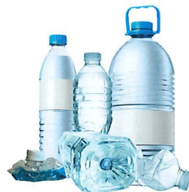
clear plastic bottles

Want to start your own fundraiser? Go to raisewithresin.com