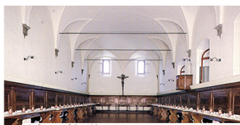
Refectory of the Abbey