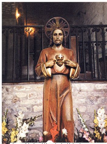
Statue of the Sacred Heart that has bled and wept

The statue, which is of natural height, was donated in 1948 by a devout person to fulfill a promise made during World War II. Christ's face has an intense expression of manly sweetness which invites all to prayer. The Heart is at the center of his chest, surrounded by a crown of thorns.