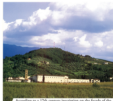
According to a 17th century inscription on the façade of the church, the Abbey of S. Maria of Rosano, was founded in 780