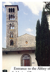
Entrance to the Abbey of S. Maria of Rosano