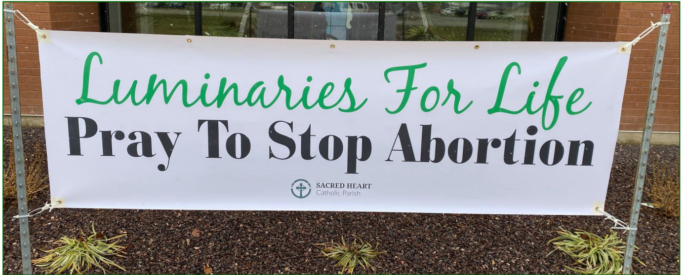
Last weekend, "Luminaries for Life" were on display here at Sacred Heart Church. The special bags were decorated by our SHS & PSR students.